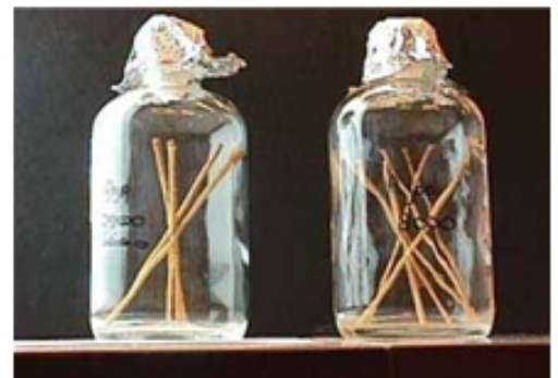
In vitro retting of flax